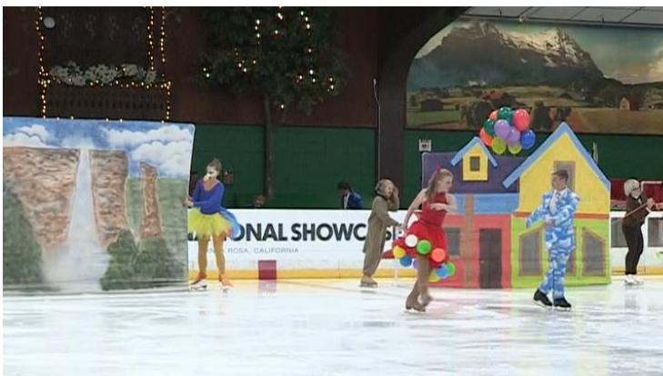
FCFSC created two backdrops for "Up" at the 2017 National Showcase Competition

Scenery also counts in judging, and includes objects or backdrops placed on the ice, such as a table, a chair, a small Christmas tree, etc. Many performers create portable backdrops of PVC pipes and painted canvas to generate a setting or mood.