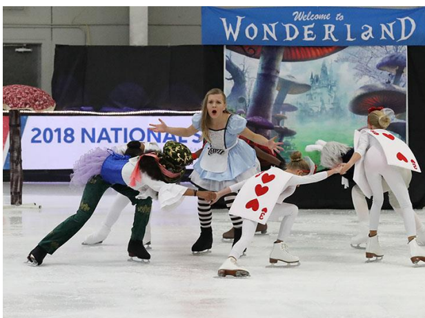
EPIC Productions 2018 mini ensemble

The FCFSC Showcase group strongly encourages all skaters and parents to assist in fundraising activities. All skaters are required to participate in at least 1 fundraising activity.