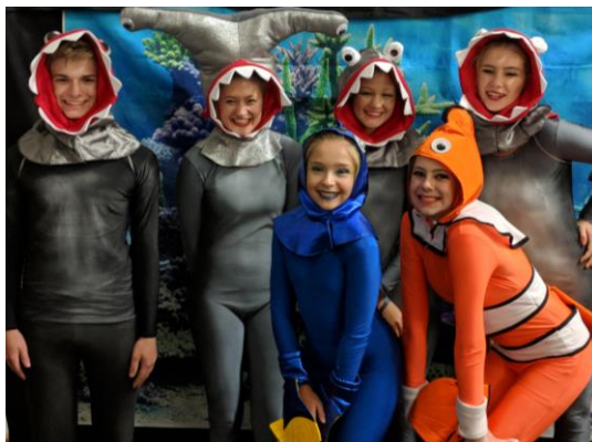
EPIC Productions' mini-ensemble Finding Nemo

Costumes must be returned to EPIC Productions after the competition.