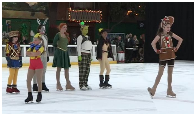
EPIC Productions' Shrek! The Musical at Showcase 2017

The competition is 5 exciting days during the first week of August. Practice ice and rehearsals at competitions can be as late as 11 p.m. and as early as 6:00 a.m.